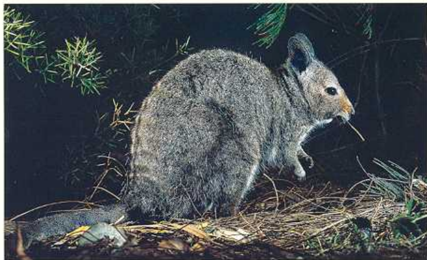
Banded hare-wallaby ( Lagostrophus fasciatus ) is now restricted to Bernier and Dorre Islands.